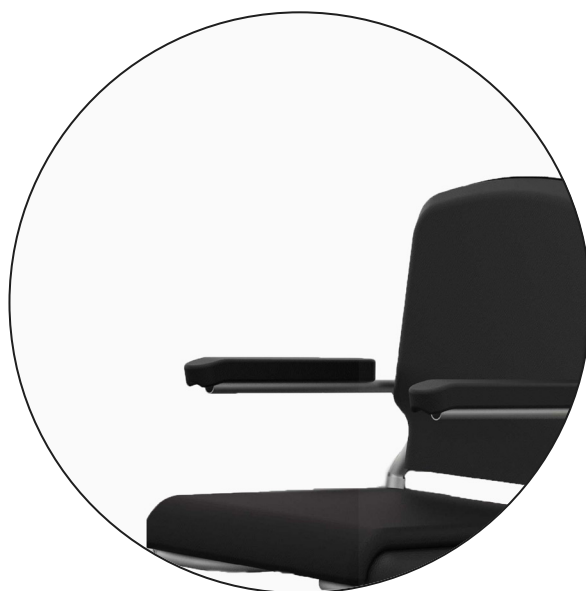
Use as Regular Chair