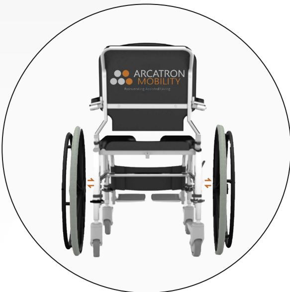
Brakes on All 4 Wheels