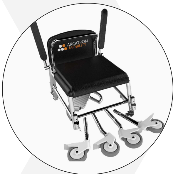
Tool-Free Assembly & Dismantling