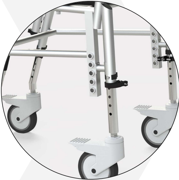
7 Level of Height Adjustment