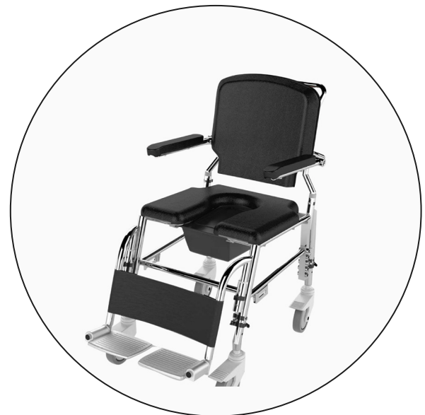
Removable Emergency Commode Pan