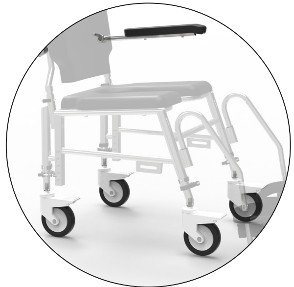
Brakes on All 4 Wheels