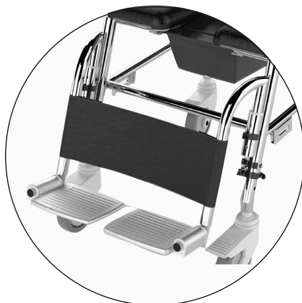
Swivel-in/out & Removable Footrests